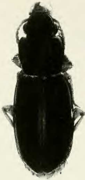
Fig. 3. Perigona wachteli sp. n. Habitus. Length of whole insect: 3.4 mm.